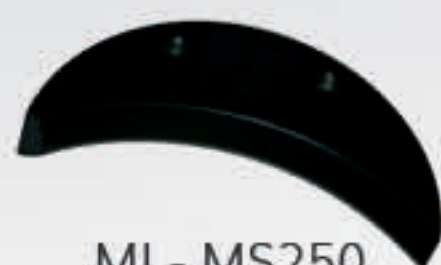
MI - MS250