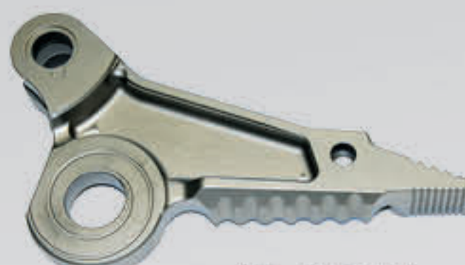
SJ - CS350