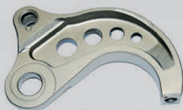
SJ - CC300