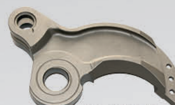
SJ - GS170