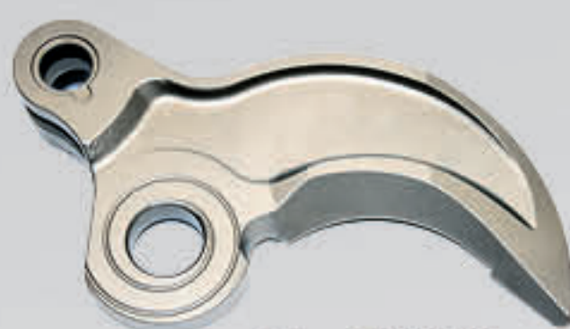
SJ - MS250