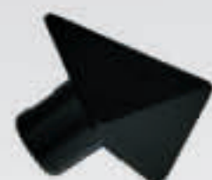
CT - CC300