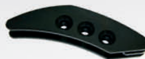
GB - GS170