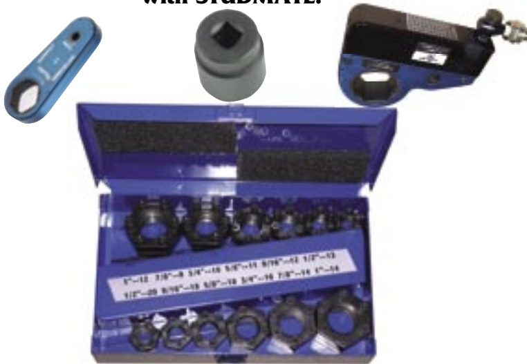
Norwolf Set 1 in custom fitted box

All common bolting tools can be used with STUDMATE .