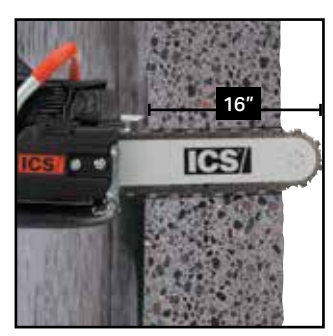
Deep cutting solution for obstructed or small openings