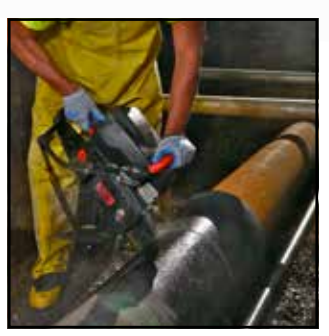
Safer to cut ductile iron