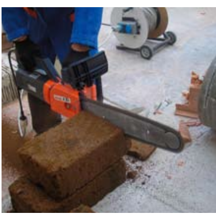
Natural soft stone cuts